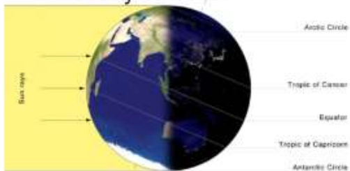
first day of winter